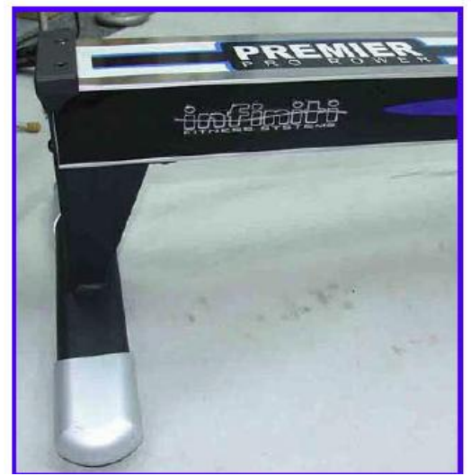
R200 Rear Stabilizer Over twice as strong