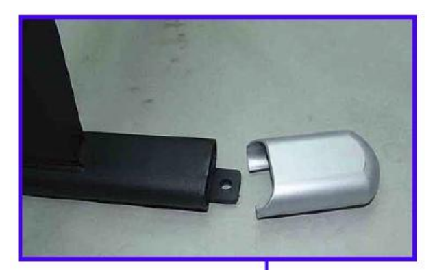
R200 Bolt to Floor Stabilizers All 4 corners of the stabilizers have a special bolt to floor tag