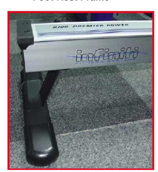
R100 Rear Stabilizer