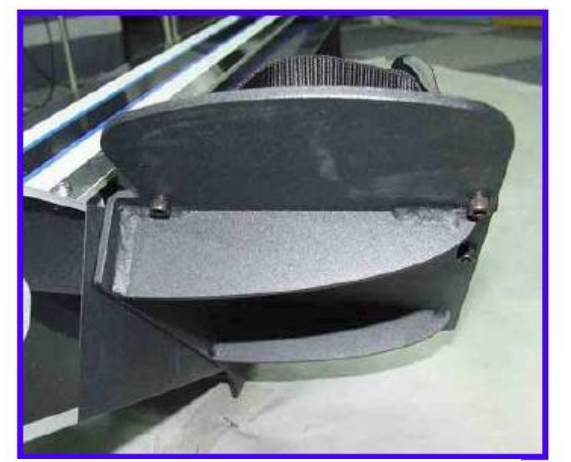
R200 Footrest Frame Over 3 times stronger